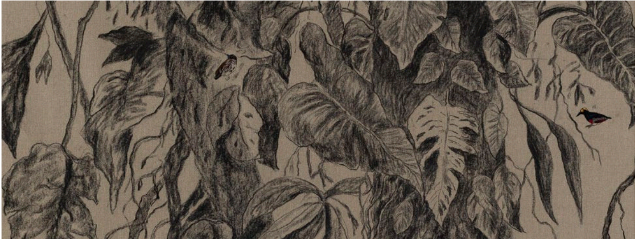
Nohemí Pérez, El bejuco de los secretos , 2024 (detail)

Nohemí Pérez's multidisciplinary work revolves around the relationship between humans and nature; the conflicts, tensions and effects that arise from this constant friction. The artist proposes a new interpretation of Colombian territories that share a very particular natural and socio-cultural ecosystem. From the time of the Conquest until today, these jungle regions have been the scene of multiple conflicts that have been transformed to create a complex web of anachronistic situations that are also characteristic of contemporary Latin America. In these forests coexist illegal armed groups of opposing ideologies, native tribes, evangelical missionaries, large agricultural, mining and drug trafficking multinationals.