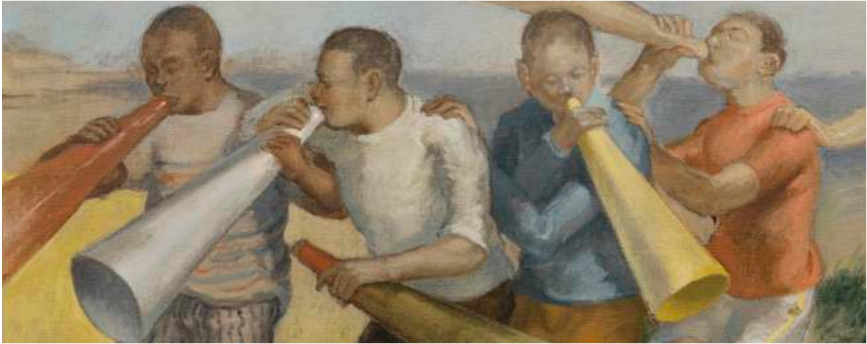
Chen Ching-Yuan, Propaganda III (détail), 2022

The ship wherein Theseus and the youth of Athens returned from Crete had thirty oars, and was preserved by the Athenians down even to the time of Demetrius Phalereus, for they took away the old planks as they decayed, putting in new and stronger timber in their places, insomuch that this ship became a standing example among the philosophers, for the logical question of things that grow; one side holding that the ship remained the same, and the other contending that it was not the same.